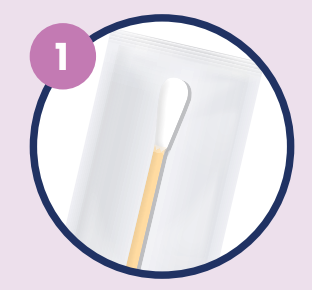
Remove a nasal swab from the pouch.