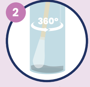
Place the swab into the extraction vial. Rotate the swab vigorously at least 5 times.