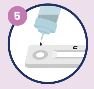
Turn vial upside down and hold sample over sample well. Squeeze vial gently. Allow the required drops according to the kit instructions, to fall into the sample well.