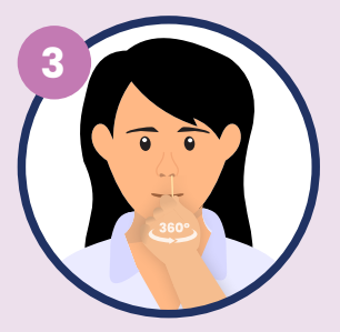
Slowly roll the swab 5 times over the surface of the nostril. Using the same swab, repeat this collection process in the other nostril.