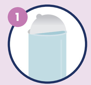
Peel off aluminium foil seal from the top of the extraction vial which contains the extraction buffer.