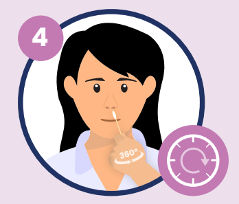
Check the kit box instructions to confirm the correct time frame to read your result. This may vary depending on the kit.