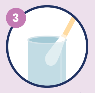
Remove the swab by rotating the swab against the vial, while squeezing the sides to release the liquid from the swab.