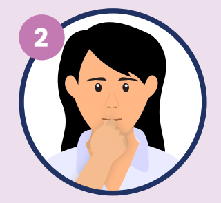
Insert the swab into one of your nostrils up to 2–3cm from the edge of the nostril.